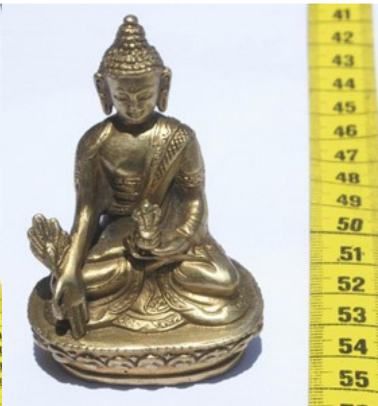
stb2 (h: 7.5 cm)