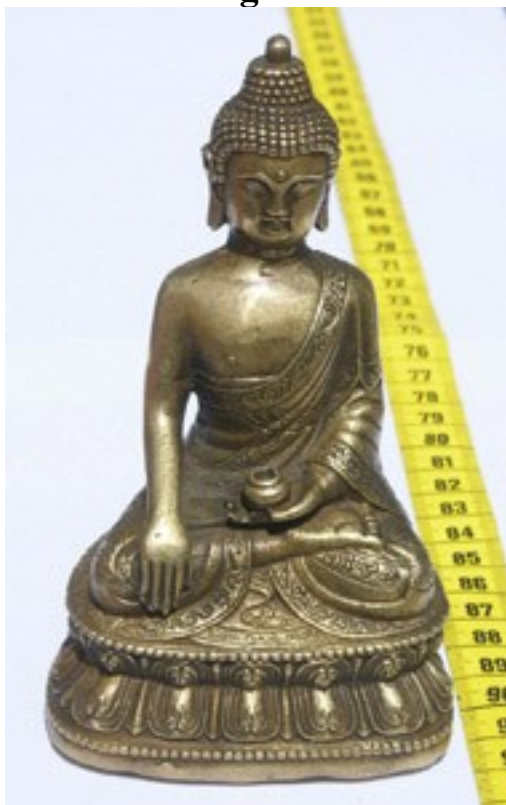
stb1 (h: 14 cm)